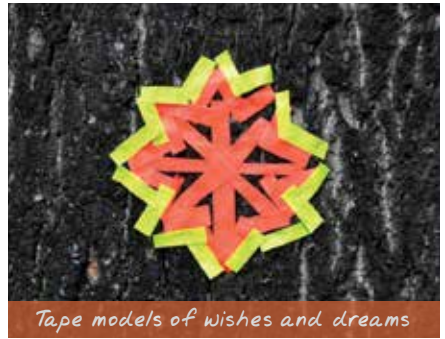
Tape models of wishes and dreams

come about when children can see and imagine what space they need and are able to transform it. They create their own space playfully by dancing, storytelling, sawing or gluing. "Places of exchange" provides the stage and materials. Here children can change spaces according to their wishes and dreams.