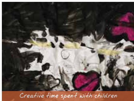
Creative time spent with children

are made possible by ZIRKUSMARIA in creative spaces. In the theater projects “TUKI explorer”, “TUKI Tandem” and the holiday project “Finding your own voice”, children and artists go on expeditions. The focus lies on playful discovery.